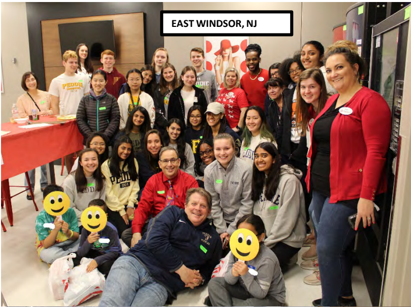
EAST WINDSOR, NJ